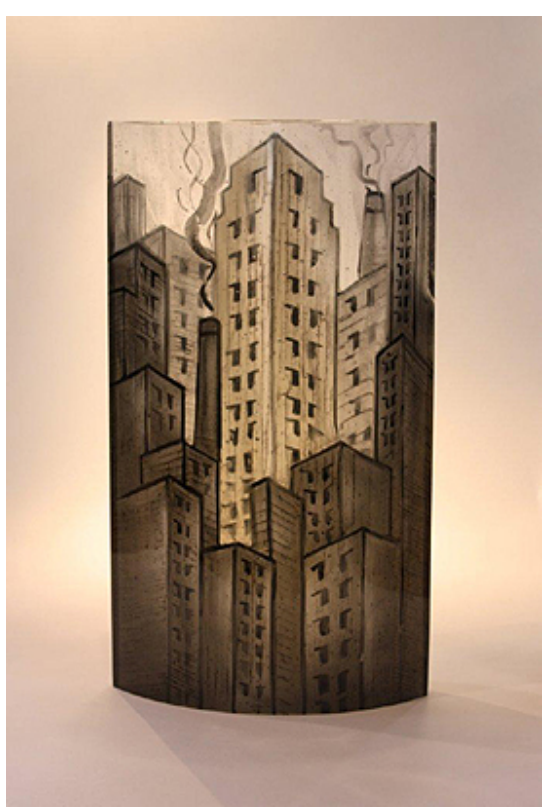
A Thousand Windows by Ruth Oliphant

In this body of work I look at the city through its patterns, colours and shapes. I use these three elements to explore the depth, space and mood of the inner city. These range from literal recognisable streetscapes to more abstracted captured moments of colour and pattern.