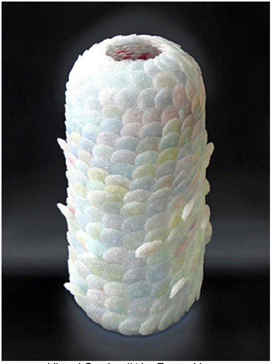
Virtual Garden #1 by Emma Varga

By singling out the details, Emma allows the viewer to focus on the colours, light and pattern.