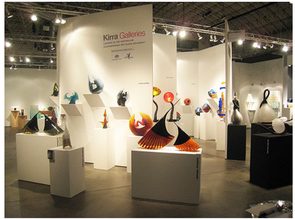
Kirra Galleries at SOFA

The Art Fair Company announced it will produce two art fairs under one roof at Chicago's historic Navy Pier, Thursday 1 November – Sunday 4 November 2012. The Intuit Show of Folk and Outsider Art will share center stage in Festival Hall with Chicago's much-anticipated art fair mainstay, the 19th Annual International Sculpture Objects & Functional Art Fair: SOFA CHICAGO 2012.