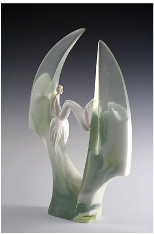
Enfold by Crystal Stubbs

I sculpt fluid human forms, and incorporate lineal, structural objects to create an interesting contrast, yet aesthetically balanced piece.